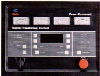
Optional Features Shown