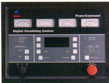
Optional Features Shown